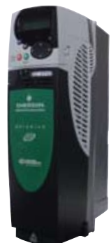
Universal AC Drives