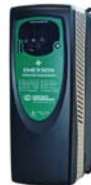
Simple AC Drives